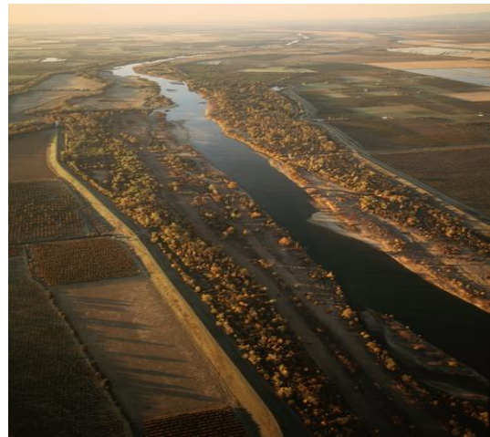
Agricultural levees built along the Feather River north of Sacramento, California.