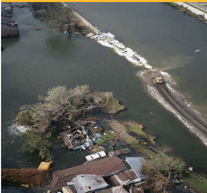
17th Street Canal levee breach in New Orleans in the aftermath of Hurricane Katrina.