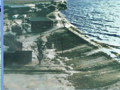
A levee breach, left, and an overtopped levee, right.