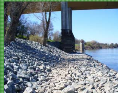
Rocks are added to the sides of levees to strengthen them.