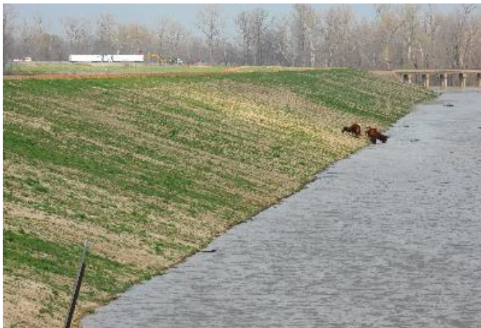
A levee in West Memphis, Arkansas.